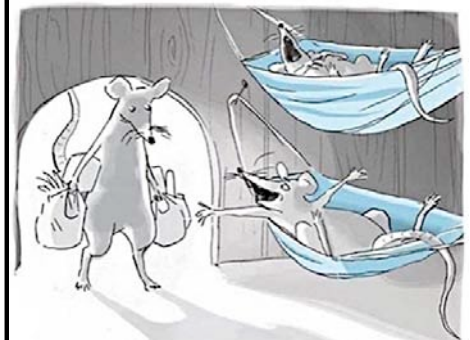
"FREE HAMMOCKS, all over town. It's like a miracle!"